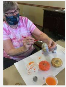
Millie turns 102!